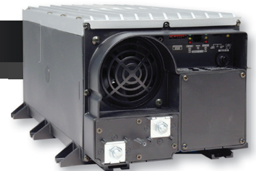
BACK-UP BATTERY ▶

This battery will automatically support the whole ventilation system and its accessory equipment. It can feed up to 20 ventilators, required for the Isocell and Polytherm membranes, for more than three (3) hours.