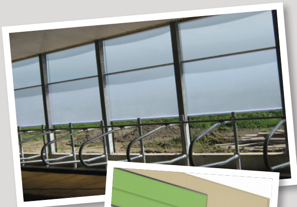
DOUBLE ROLL-UP CURTAIN ▶