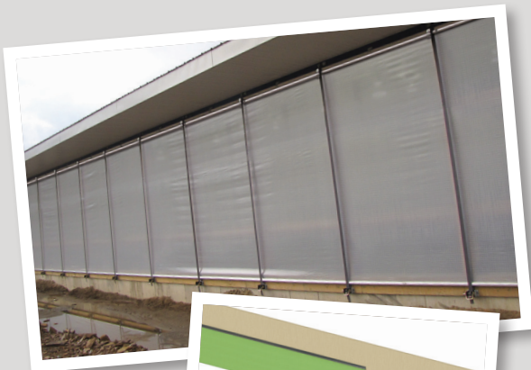
SIMPLE ROLL-UP CURTAIN ▶