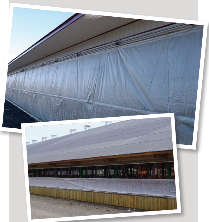
FIXED OR REMOVABLE ▲ SINGLE CURTAIN

The transmission shaft system enables you to have a more reliable system by eliminating pulley adjustments that are necessary with traditional systems. A main steel rod is installed at the top of the opening all along the building and serves as a transmission shaft for the curtains. Once the rod is put into motion it enables the cables that are holding the curtains to roll up around it, also making the curtains go up or down automatically. The Maxum actuators are heavy duty and reliable. They are always supplied with potentiometer for more precision. There is also the possibility to replace the corner pulley with a high performance chain system to eliminate the corner tension on the main steel cable.