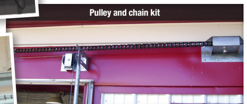
Pulley and chain kit