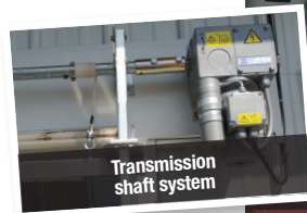
Transmission shaft system